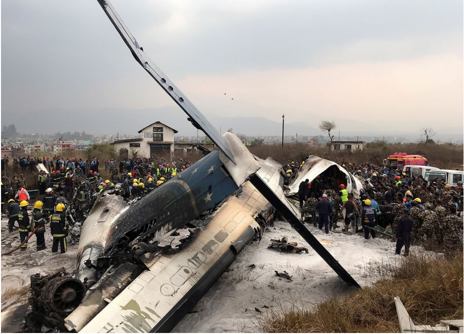
Figure I. Chitrakar, Navesh (2018) Plane crash in Nepal. Published with the kind permission of Reuters Pictures.

The interviewed professionals assessed whether certain images should be published or circulated by evaluating the impact and significance of the photographed event in relation to the potential harm that its publication might cause. Further, the level of graphicness has to be in line with the significance of the real-world event.