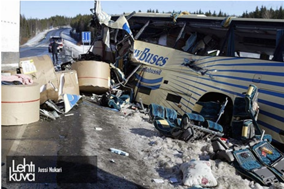
Figure 2. Bus accident in Konginkangas, Finland.