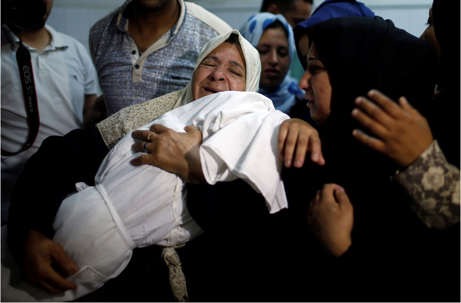
Figure 3. Salem, Mohammed (2018) Funeral of an infant in Gaza City. Published with the kind permission of Reuters Pictures.

Providing neutral reporting is also a part of the agency's captioning and keywording practices. Biased words, such as 'terrorist', will be replaced by more neutral terms, such as 'fighter', in image captions. Earlier research has also acknowledged a similar tendency of avoiding taking a stand in editorial language (Barkho, 2019). The maintenance of neutrality and balance ensures the news agency access to conflict zones. Thus, the choice of whose suffering will be represented in news media is not solely determined by the ideological values of journalism nor the qualities of the images but the very structures that make the production of those images possible in the first place. Meanwhile, the idea of balance often comes to stand for journalistic objectivity (Gürsel, 2017: 41–46).